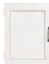
BEAD FRAME (WOOD OR GLASS PANEL)