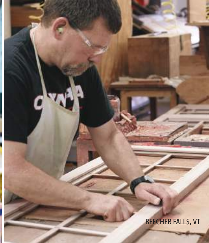
BEECHER FALLS, VT

ETHAN ALLEN GOT ITS START DURING THE GREAT DEPRESSION AND SPENT ALMOST A CENTURY BUILDING ITS BONA FIDES AS A PROUD AMERICAN BRAND. TODAY, WE CHOOSE TO CONTINUE MAKING ABOUT 75% OF OUR FURNITURE IN OUR VERY OWN NORTH AMERICAN WORKSHOPS.