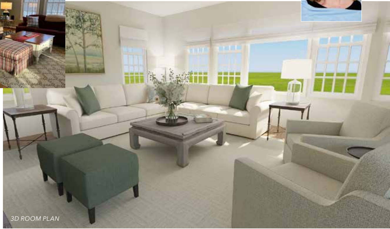
3D ROOM PLAN