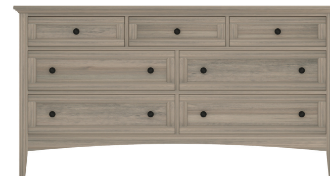
560-440-803 Revere Dresser