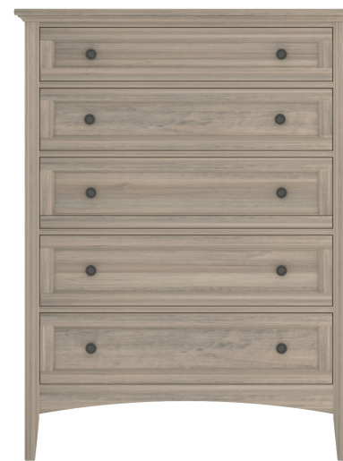
560-455-803 Revere Tall Chest