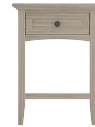
560-461-803 Revere 1-Drawer Night Stand