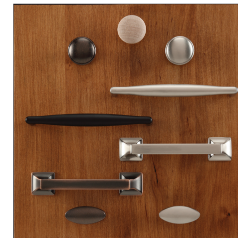
Choose from a selection of curated hardware.