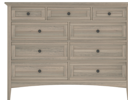
560-445-803 Revere Media Dresser