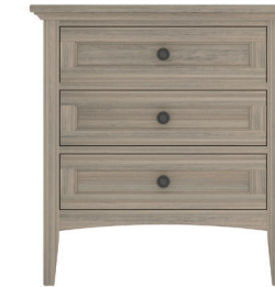
560-463-803 Revere 3-Drawer Night Stand