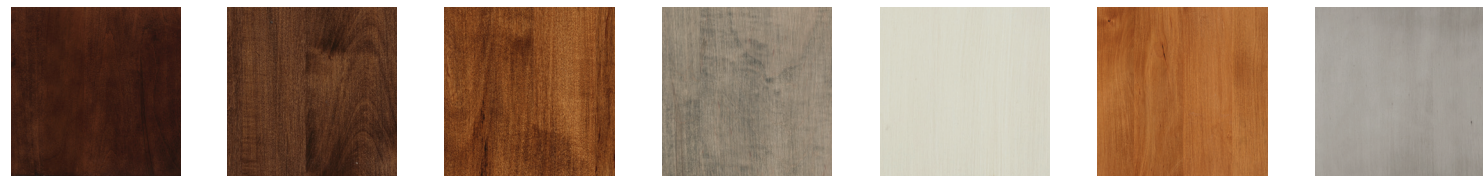
800 Clay 801 Coast 802 Bay 803 Bluff 804 Ember 805 Dune 806 Mist